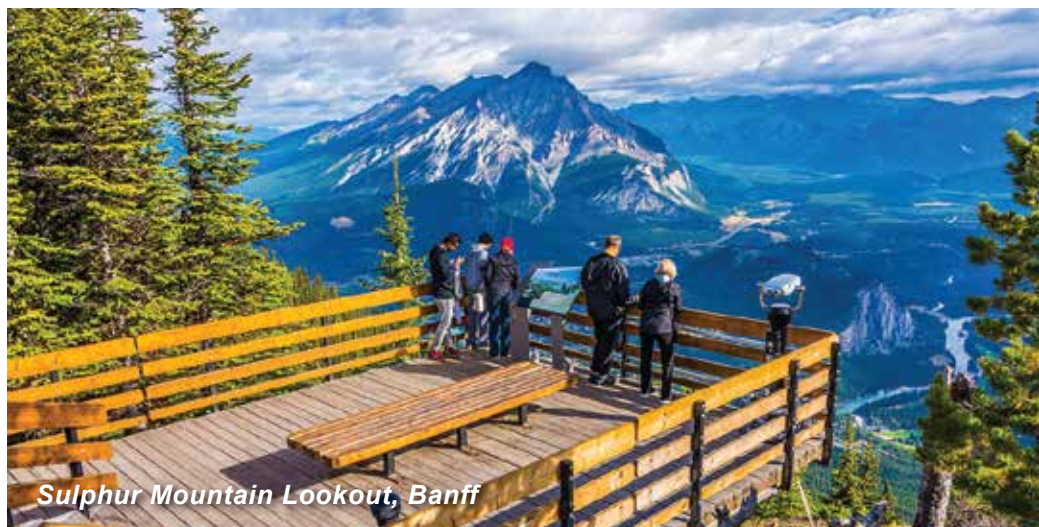
Sulphur Mountain Lookout, Banff