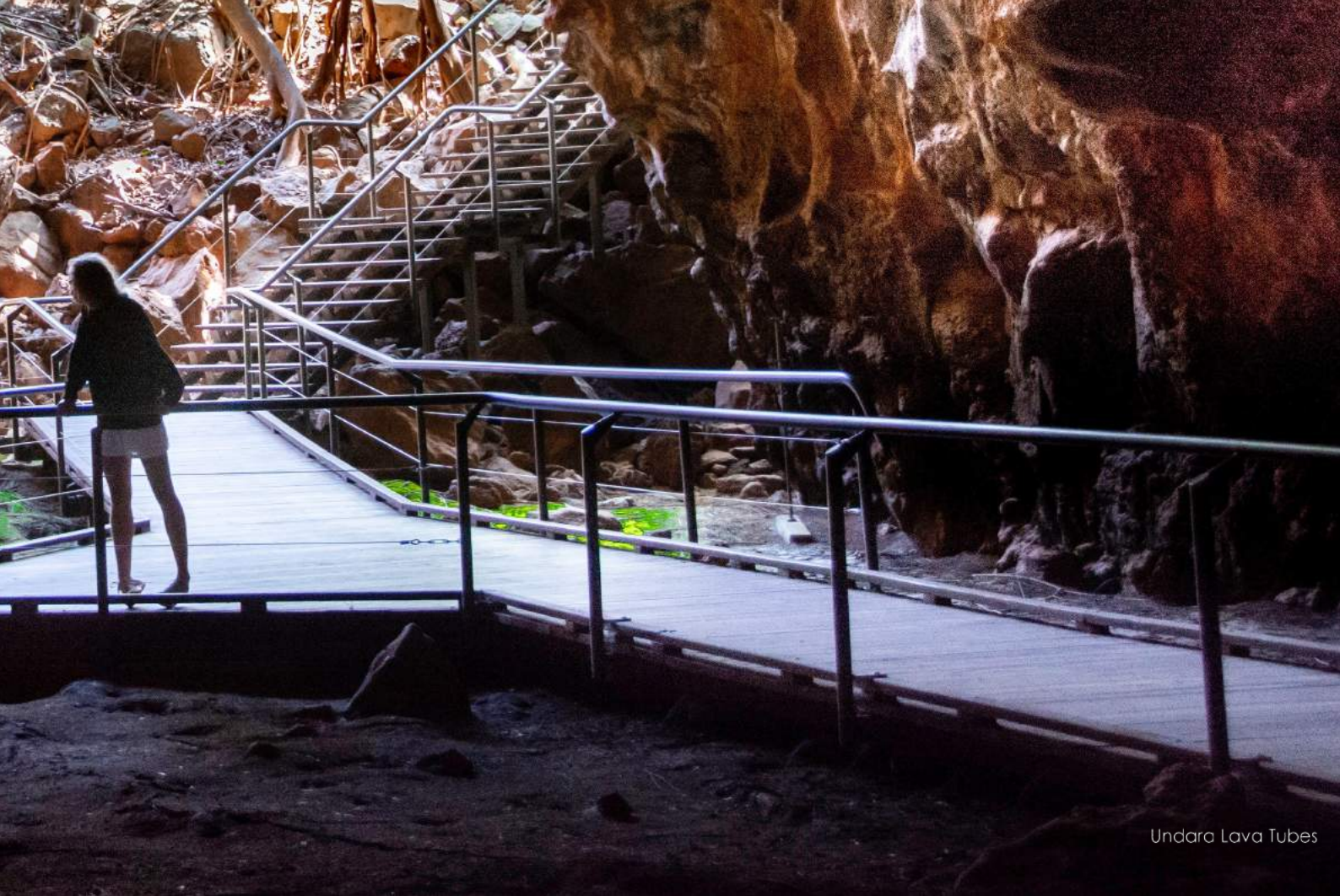
Undara Lava Tubes