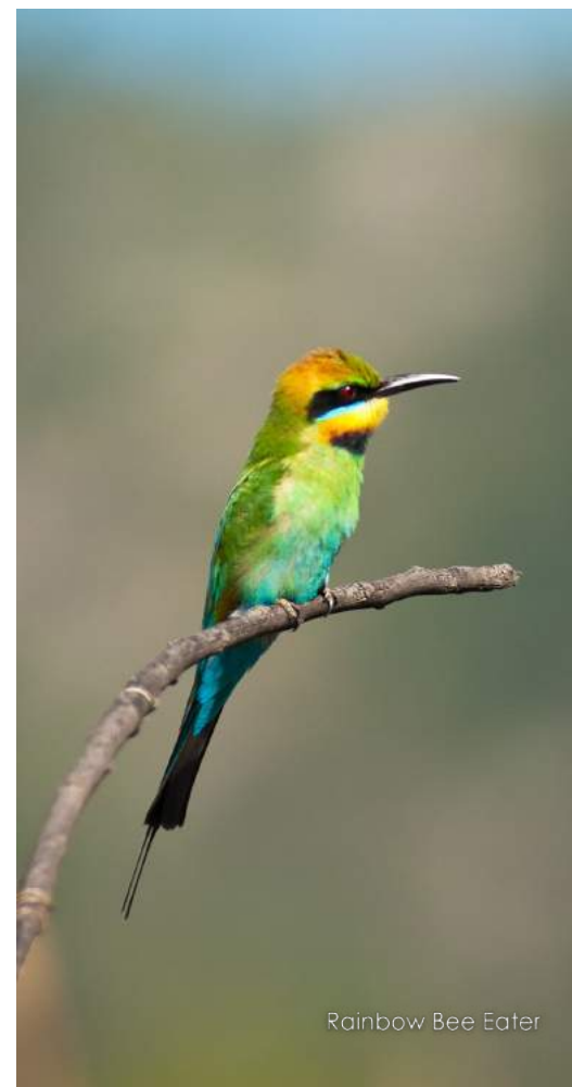
Rainbow Bee Eater

This morning we will have an early breakfast at the hotel before we are transferred to Cairns Railway Station to board the Spirit of Queensland. We will enjoy a full day on board as we travel back down the Queensland coast. Our Tour Host will travel to Mackay and will bid you farewell in Townsville or on arrival in Mackay.