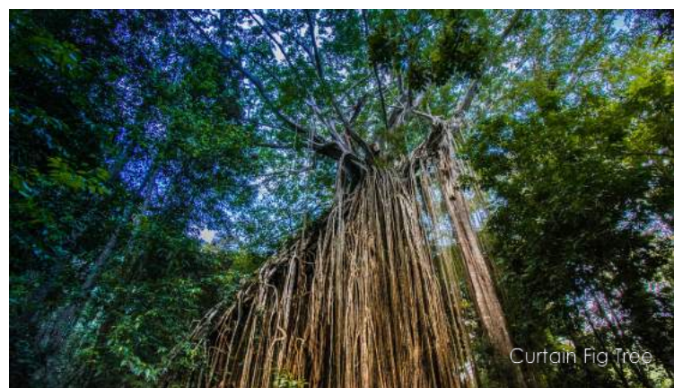
Curtain Fig Tree