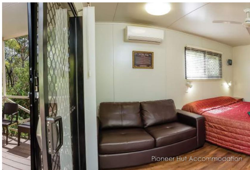
Pioneer Hut Accommodation