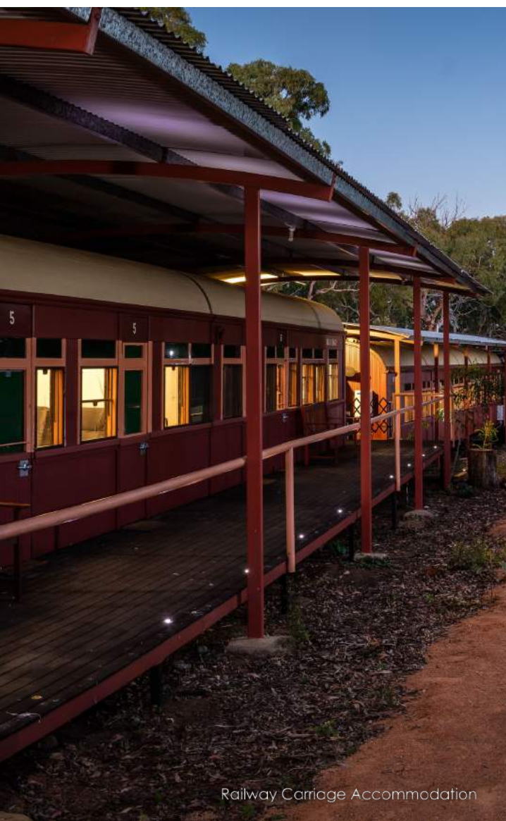
Railway Carriage Accommodation