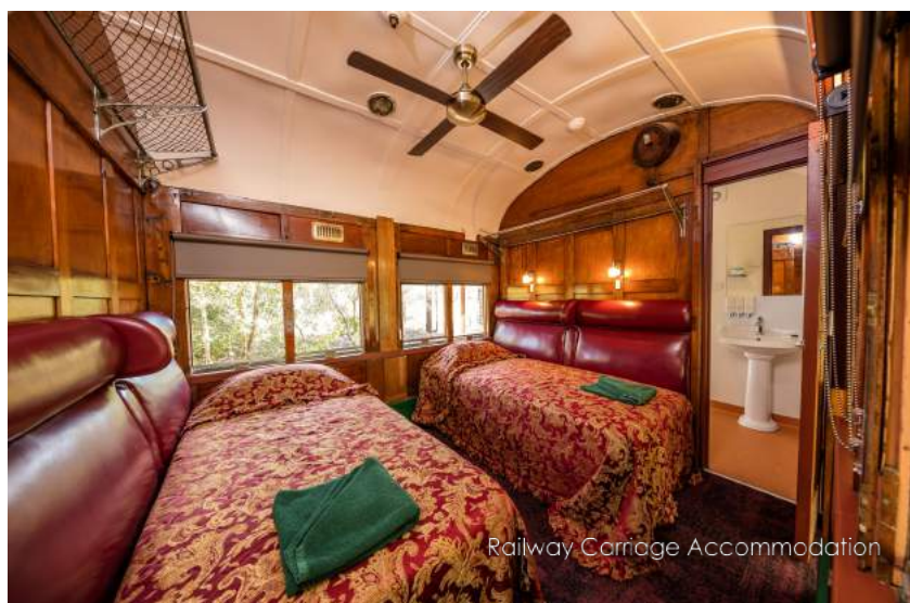
Railway Carriage Accommodation